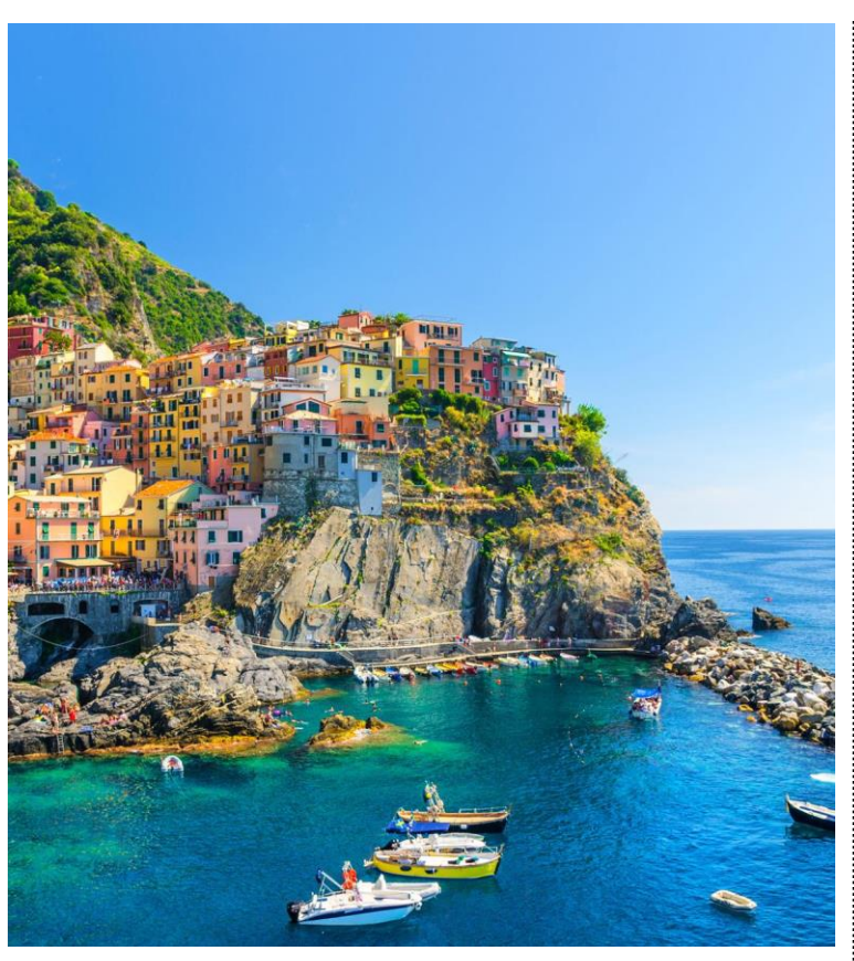
9 Days ● 12 Meals: 7 Breakfasts, 1 Lunch, 4 Dinners

HIGHLIGHTS... Turin, Langhe Wine Country, Barolo Winery, Italian Riviera, Cinque Terre, Lucca, Tuscan Estate, Florence, Greve in Chianti